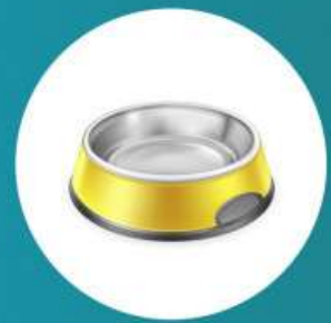
Animal feeding containers